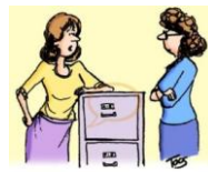
"Until I became a mother, I didn't know the true meaning of '24/7'."

Mom great job, I'm Awesome. -Happy Mother's Day!